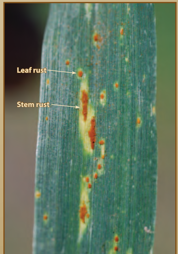
Figure 2. Comparison of the stem rust and leaf rust lesions on leaf tissue. Note the larger diamond shape of the stem rust relative to leaf rust.

Differentiating the rust diseases can be difficult, but with practice they can be reliably identified. Begin by considering broad characteristics such as which plant parts are affected (Figure 1) or arrangement of the blister-like lesions on plants. These characteristics will often separate one or more of these diseases quickly. Continue by examining less obvious characteristics including lesion size, shape, and color to either confirm the diagnosis or separate the more similar diseases. For example, stripe rust is the only one of these diseases to have the blister-like lesions organized into stripes on the leaves (left). If the lesions are scattered on the affected plant parts, both stem rust and leaf rust are a possibility and additional characteristics must be considered. Leaf rust typically causes small, round lesions on the leaf blades and leaf sheaths. In comparison, stem rust causes oval or elongated lesions and is capable of infecting nearly all aboveground parts of the plant, most notably the true stems (Figure 2).