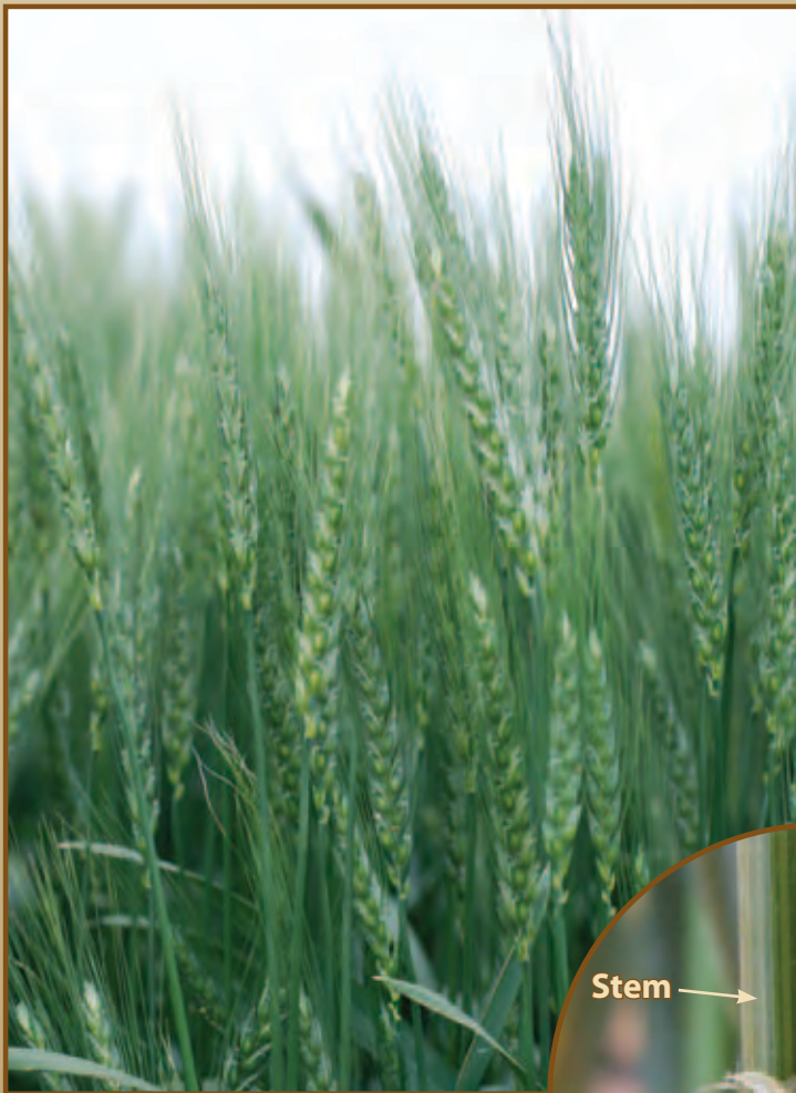
Figure 1. The diagnosis of rust diseases requires some basic understanding of plant anatomy and a quick review of this information may improve the accuracy of the identification process.

depends on host susceptibility and weather conditions, but the loss also is influenced by the timing and severity of disease outbreaks relative to crop growth stage. The greatest yield losses occur when one or more of these diseases occur before the heading stage of development. Early detection and proper identification are critical to in-season disease management and future variety selection.