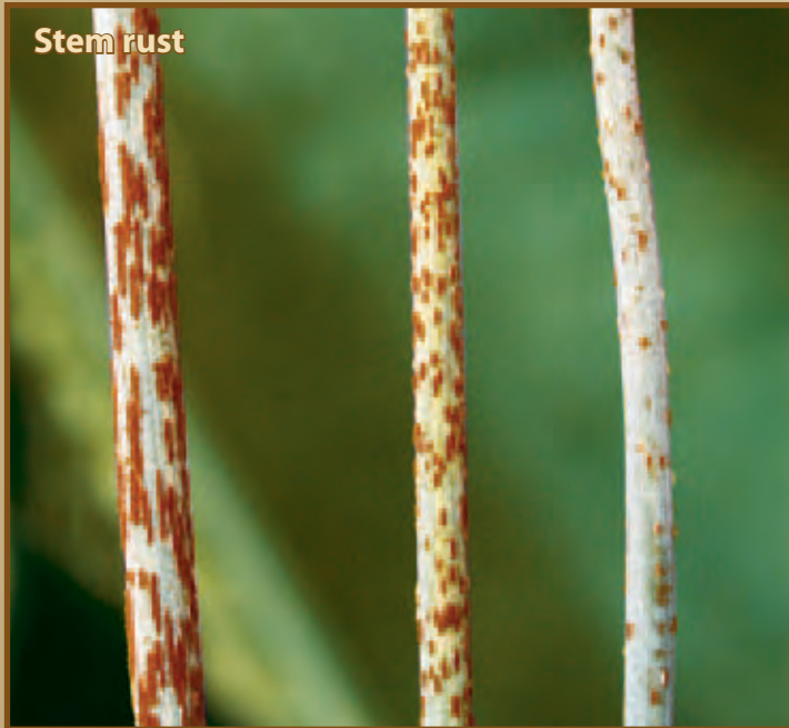
Figure 3. Examples of the variability in symptoms caused by stem rust (below), leaf rust (upper right) and stripe rust (lower right) as a result of unique interactions with wheat or barley varieties.

All three diseases have unique interactions with common varieties of wheat and barley. These interactions can modify the disease symptoms resulting in reduced lesion size and varying amounts of yellow or tan tissue surrounding the lesions (Figure 3). Becoming familiar with the range of possible symptoms for these diseases will improve the accuracy of the diagnosis and the management of these economically important diseases.